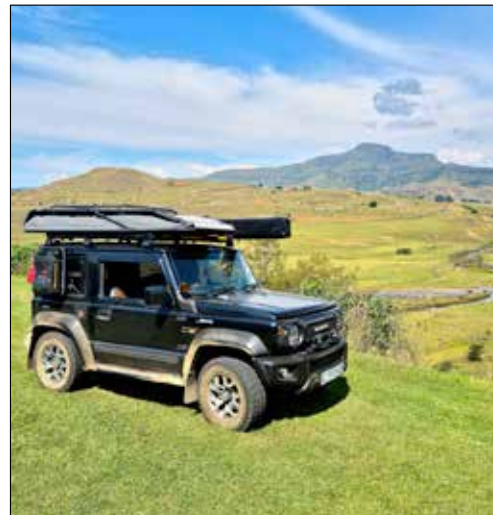
View of the Tugela River near Royal Natal National Park

The Jimny is a little mountain goat eager to take on any mountain or river cross-