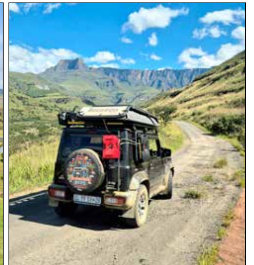
Taking in the beauty of Allah's creation in the Royal Natal National Park

ing. So many people ask me: "Aren't you afraid to travel & camp solo? Don't you get lonely on the road? What would you do in an emergency in the middle of nowhere?"